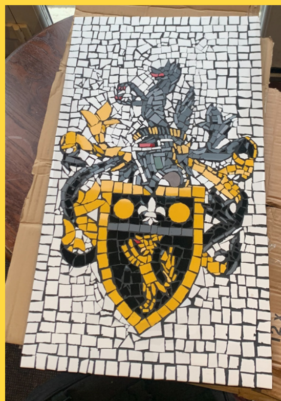
The beautiful mosaic produced by the Arts Network, ready for display

Whilst thanking this wonderful charity, I have no doubt that they will agree with me that the most important aspect of all of this is to draw attention to those with mental health issues and to help them in any way they can, and I am confident that the readers of 'Wolf Salient' will endorse these admirable sentiments.