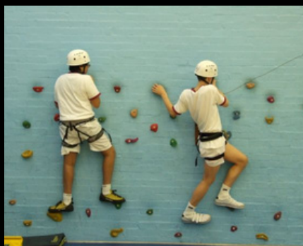
Wilson's Climbing Club in action on the school's climbing wall in 2009!