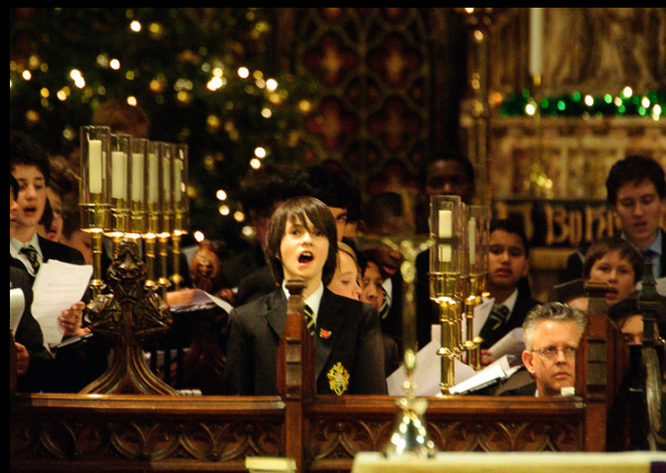
A few shots from Wilson's Carol Service in December 2012, held in Croydon Minister.