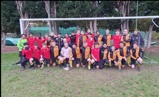
Old Wilsonians Football Club's (OWFC) 1st Team and Wilson's School's 1st XI pictured together after Vice President's Day on 3rd December 2022. Part of an annual set of fixtures, the Old Boys played three separate games against school sides, winning two and losing one. Wilson's boys were introduced to OWFC's ground, facilities and clubhouse at Hayes, and we hope that many will return to play for Old Wilsonians in the future!