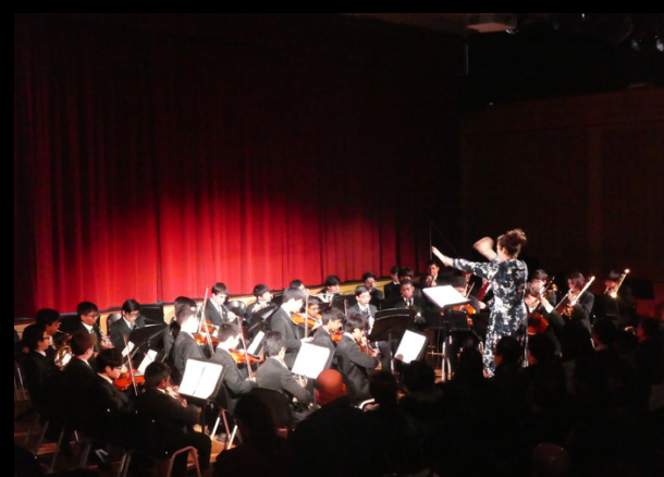
A few shots from the Wilson's Spring Concert in March 2023, held at the school.