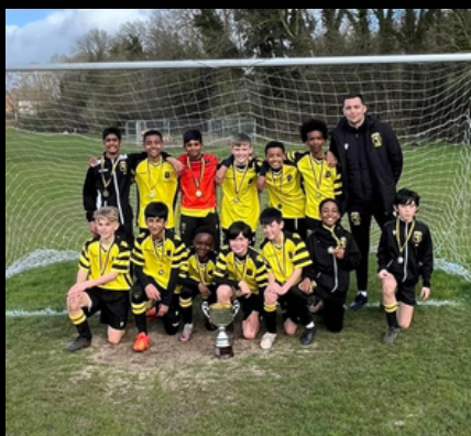
Wilson's 1st XI (above) and the Year 7A Team (left) after both winning the Sutton Cup in March 2023, continuing Wilson's long-standing tradition of footballing excellence! Best of luck to the Wilson's boys in the 1st XI who are leaving the school this summer!