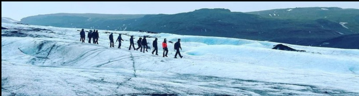
Glacier walking on the Wilson's Geography Trip to Iceland in March 2023!