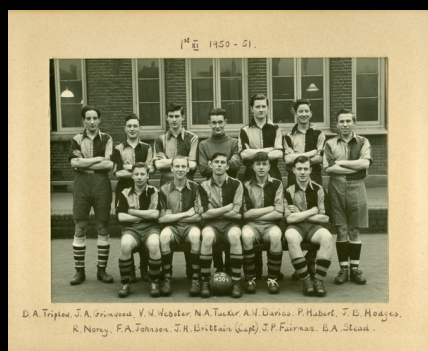
Wilson's Football 1st XI photographed at the end of the 1950/51 season!