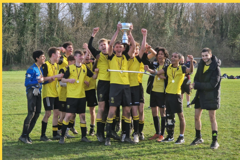
The 1st XI celebrating their Sutton Cup win

On 29th March 2023, we were delighted to see both the 1st XI and the Year 7s win the Sutton Cup!